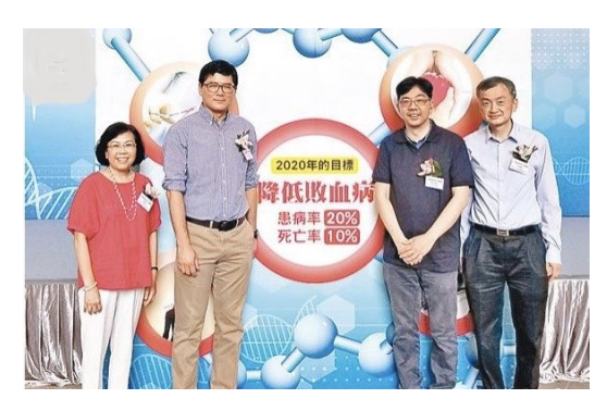
2019 年健康展覽活動: 敗血病知多 D

and adding new ones to maintain highest teaching quality of our Association.